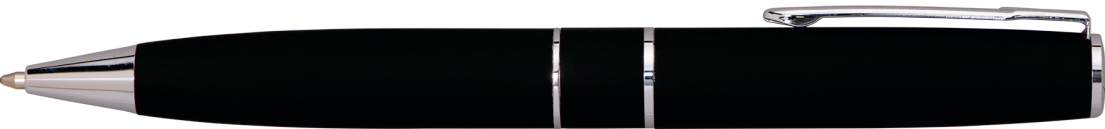
Black w/ black ink