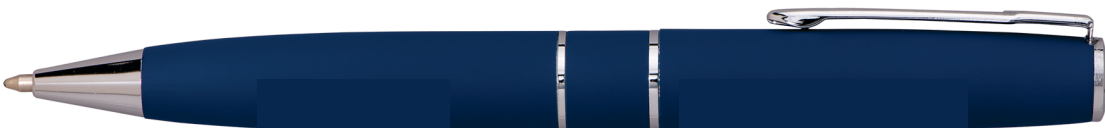
Blue w/ black ink