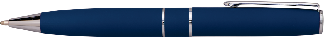
Blue w/ black ink