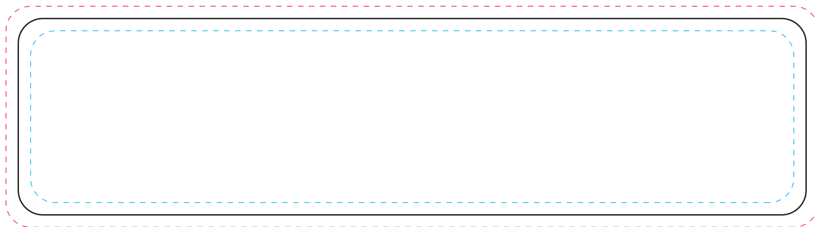
ROUND CORNERS ( Round corners will incur additional charges )