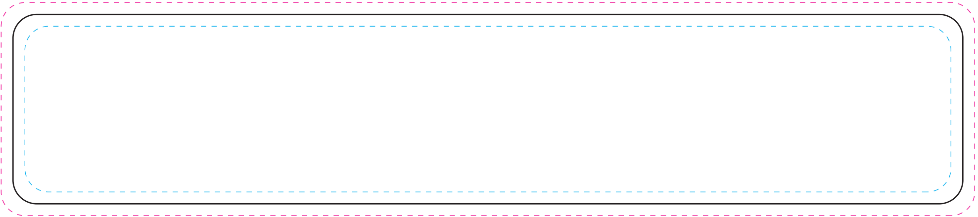
ROUND CORNERS (Round corners will incur additional charges)